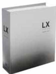
ECOS LX-1000 SERIES

We are delighted to inform you that Suminoe Co., Ltd launched on February 13 th ECOS LX-1800 TIDE, a new pattern of ECOS LX-1000 series.